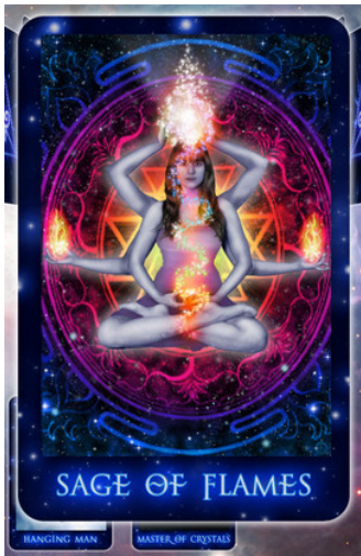
Figure 5. Image from “Sirian Starseed Tarot” (New Age)

than ever in aesthetics, experience, and affect, each of which is an important part of spirituality. We contend that studying spirituality and religion would broaden and deepen our understanding of these aspects of life.