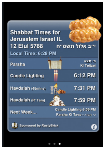
Figure 3. Image from "Shabbat Shalom" (Jewish)