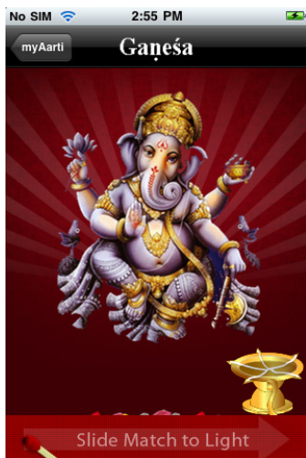
Figure 4. Image from "MyAarti" (Hindu)

apps with features and uses that we have found to be largely missing from the current HCI literature: