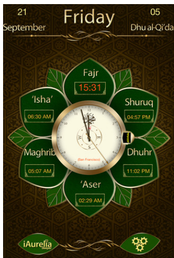
Figure 1. Image from “MyPrayer” (Islamic)